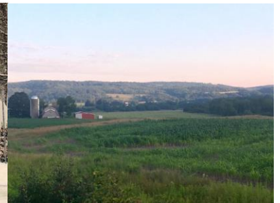
My hometown: Oxford, NY